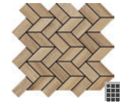
MOSAIC RUBIC NOBLE CAMEL (PIECE) 27.1x29.5x1 cm DC1012 | GJ37