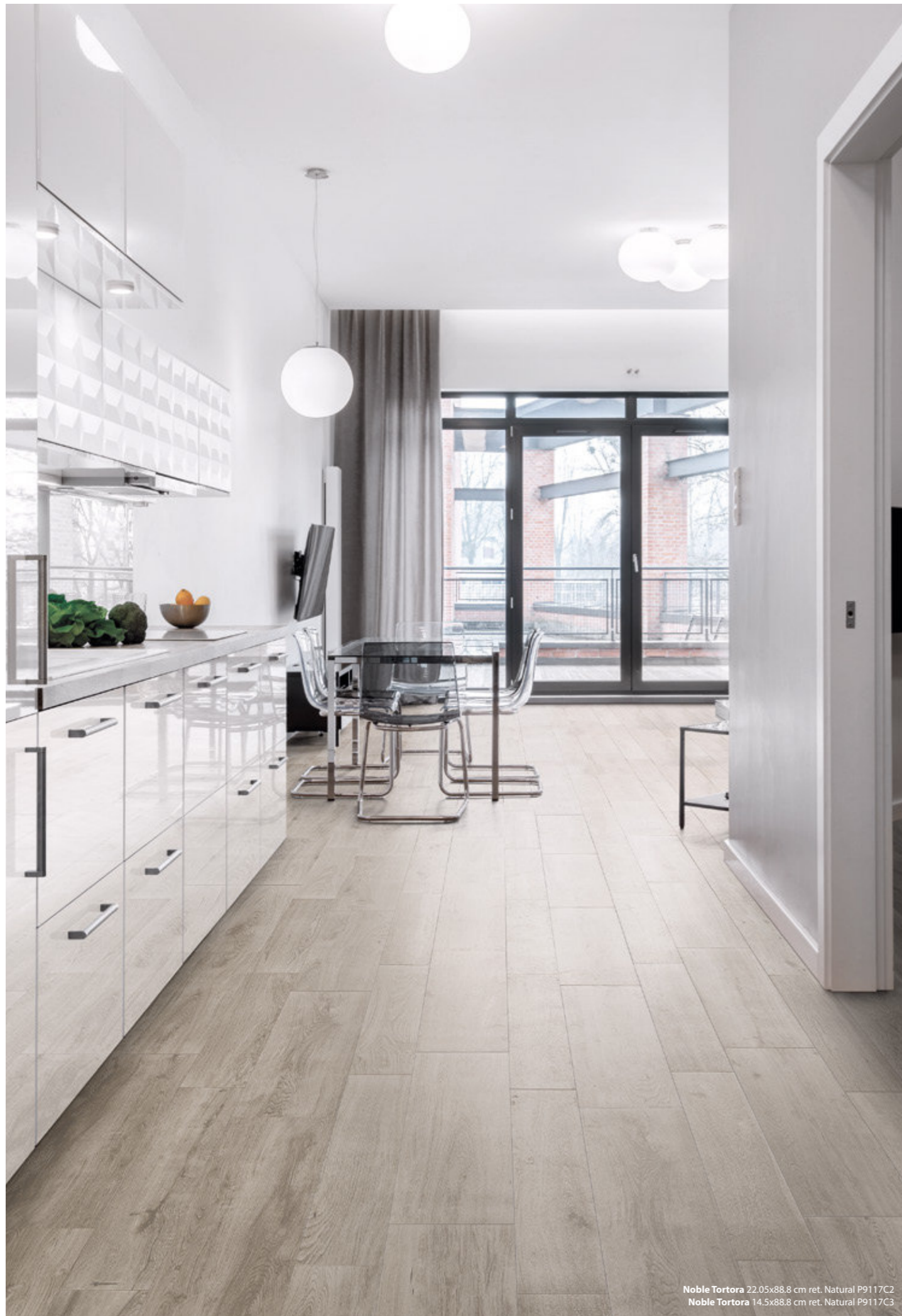
Noble Tortora 22.05x88.8 cm ret. Natural P9117C2 Noble Tortora 14.5x88.8 cm ret. Natural P9117C3