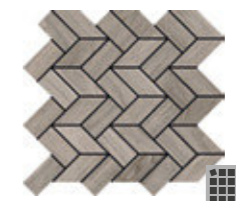
MOSAIC RUBIC NOBLE BRUME (PIECE) 27.1x29.5x1 cm DC1013 | GJ37