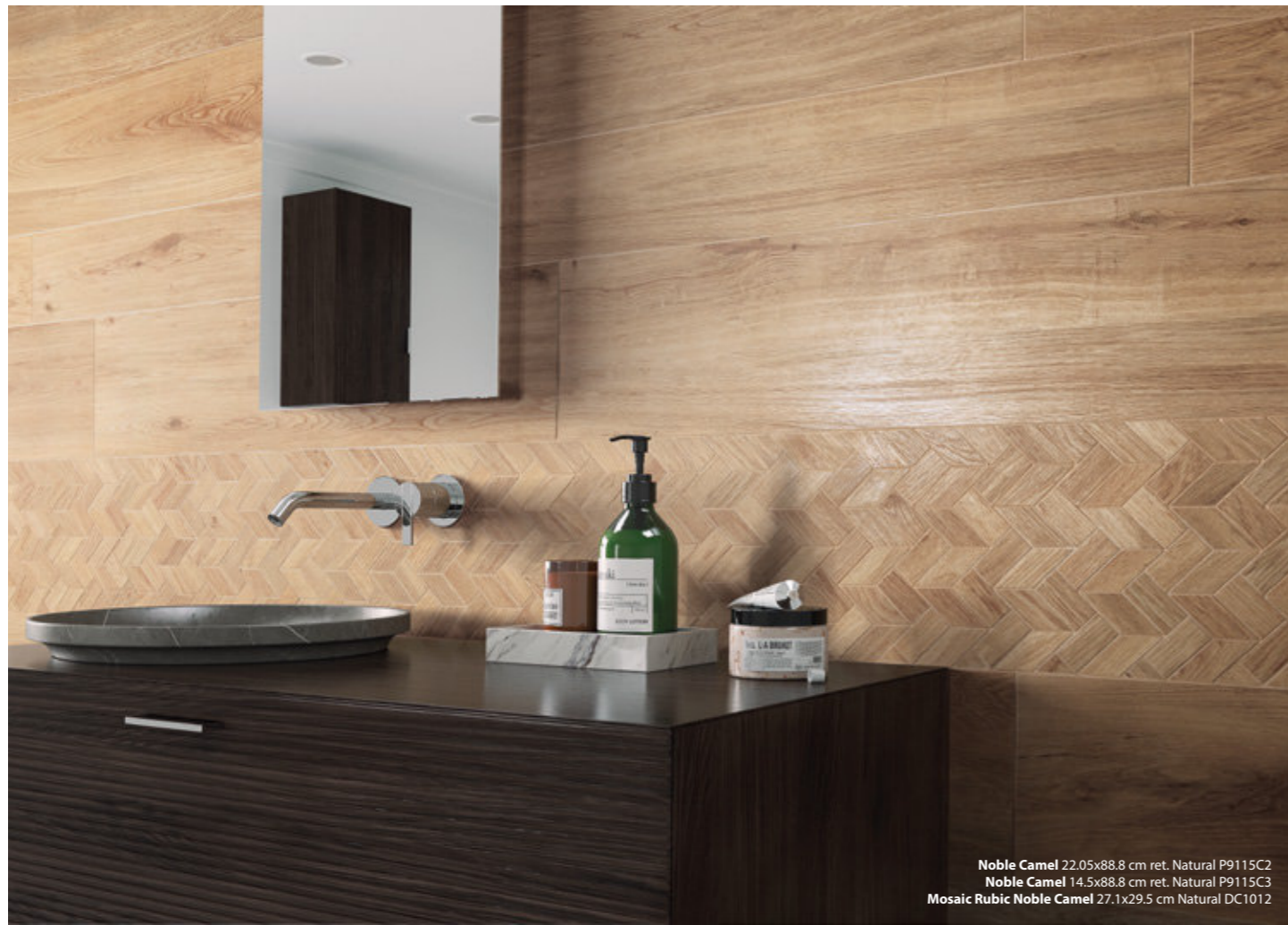
Noble Camel 22.05x88.8 cm ret. Natural P9115C2 Noble Camel 14.5x88.8 cm ret. Natural P9115C3 Mosaic Rubic Noble Camel 27.1x29.5 cm Natural DC1012