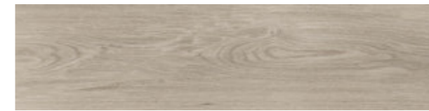
TORTORA 22.05x88.8 cm ret. P9117C2 | GD10 P9121C2 | GD11