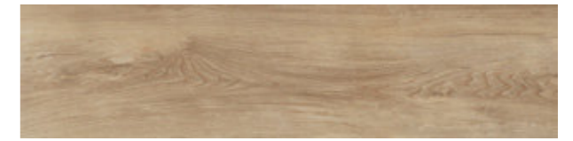
CAMEL 22.05x88.8 cm ret. P9115C2 | GD10 P9119C2 | GD11