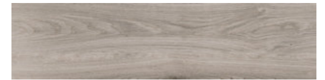
BRUME 22.05x88.8 cm ret. P9116C2 | GD10 P9120C2 | GD11