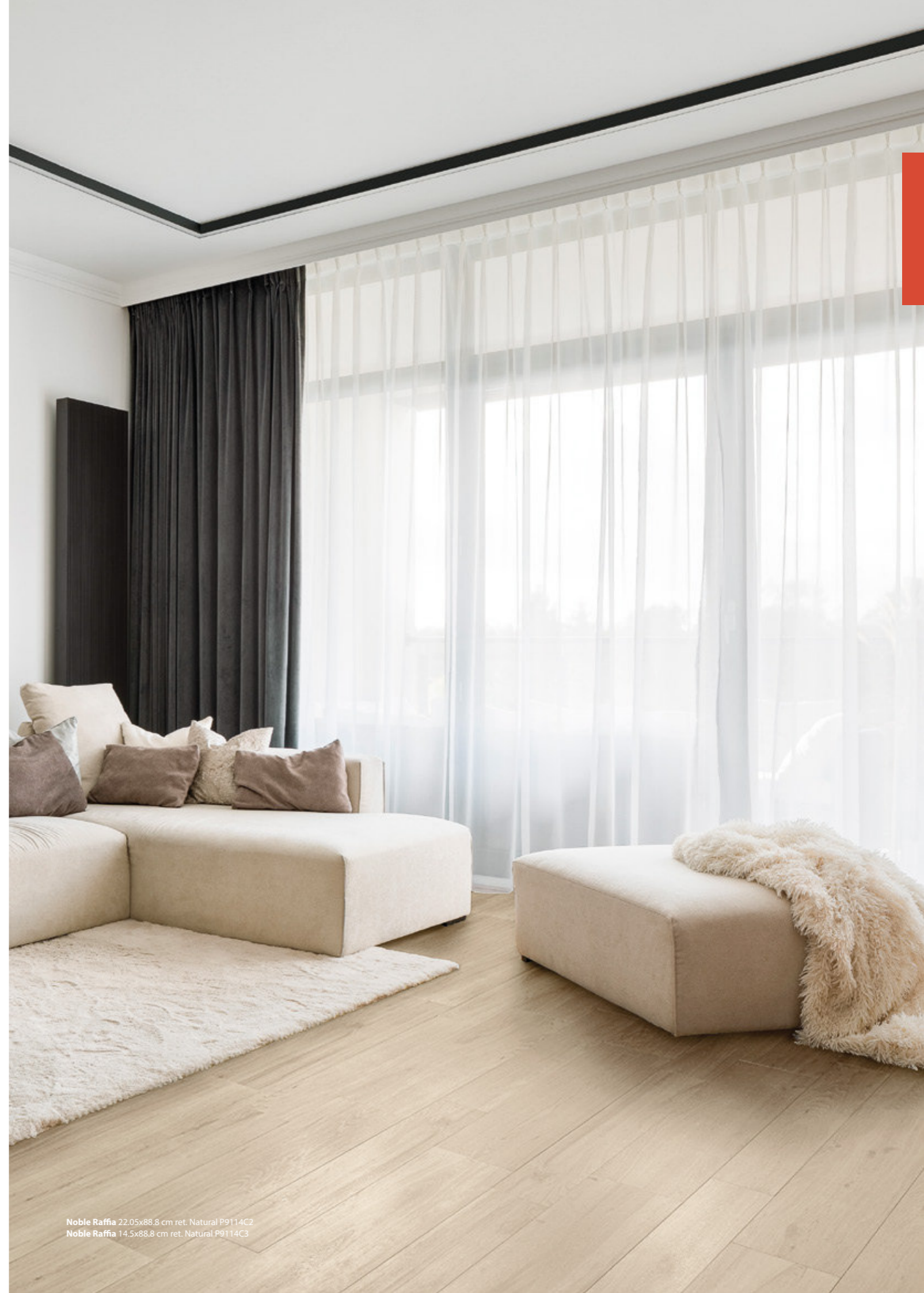
Noble Raffia 22.05x88.8 cm ret. Natural P9114C2 Noble Raffia 14.5x88.8 cm ret. Natural P9114C3