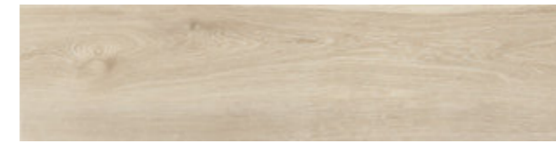
RAFFIA 22.05x88.8 cm ret. P9114C2 | GD10 P9118C2 | GD11