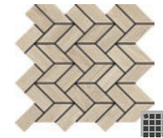
MOSAIC RUBIC NOBLE RAFFIA (PIECE) 27.1x29.5x1 cm DC1011 | GJ37