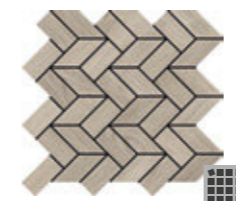
MOSAIC RUBIC NOBLE TORTORA (PIECE) 27.1x29.5x1 cm DC1014 | GJ37