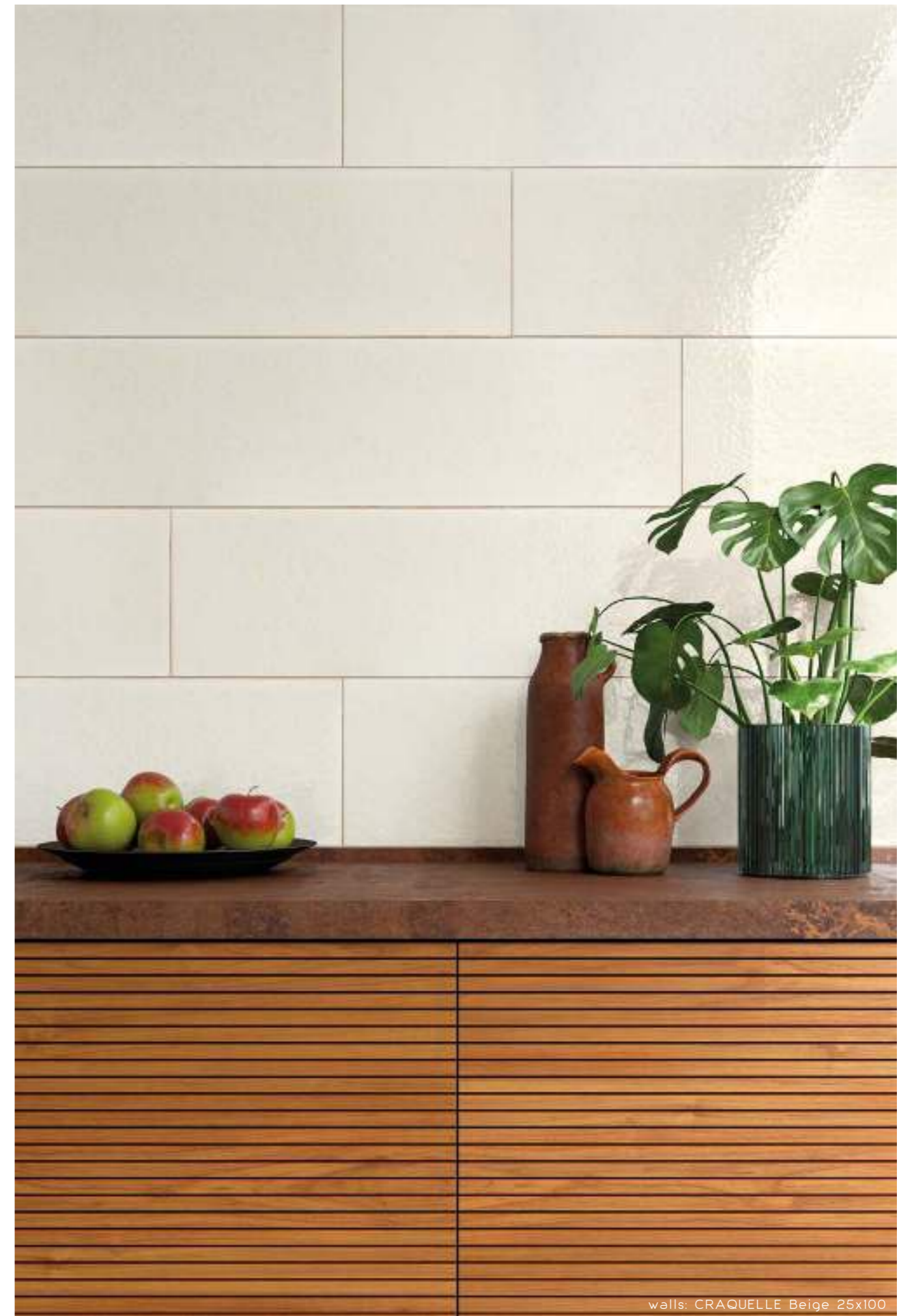
walls: CRAUELLE Beige 25x100