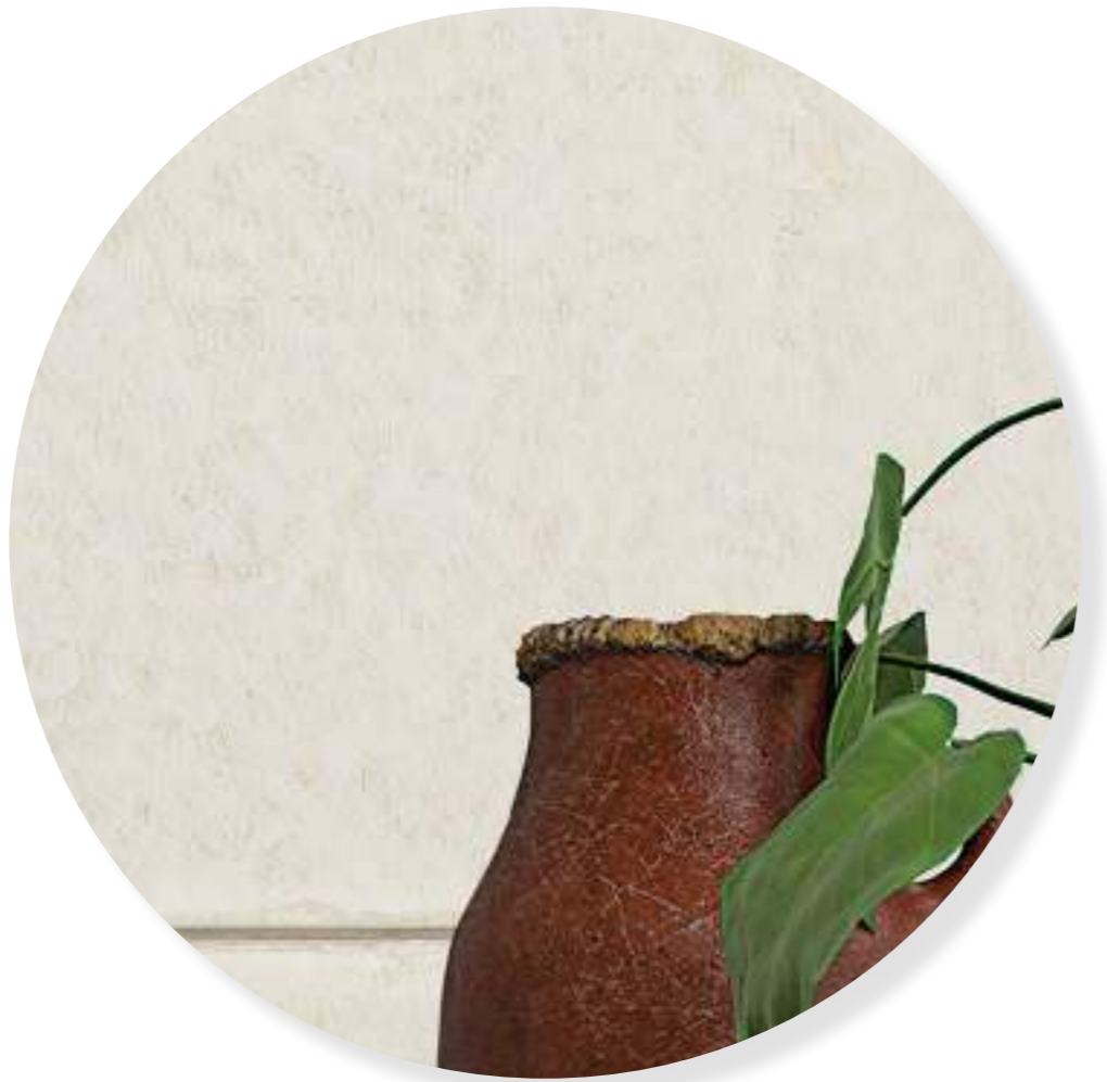
walls: CRAUELLE Beige 25x100