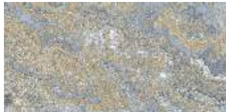
AGATE BLUE LAP RECT. 60X120 / 24"X48" L81/M