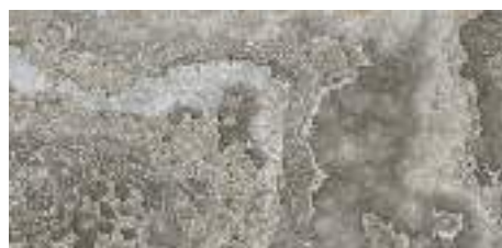
AGATE GREY LAP RECT. 60X120 / 24"X48" L81/M