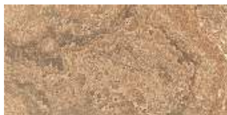
AGATE SUNSET LAP RECT. 60X120 / 24"X48" L81/M