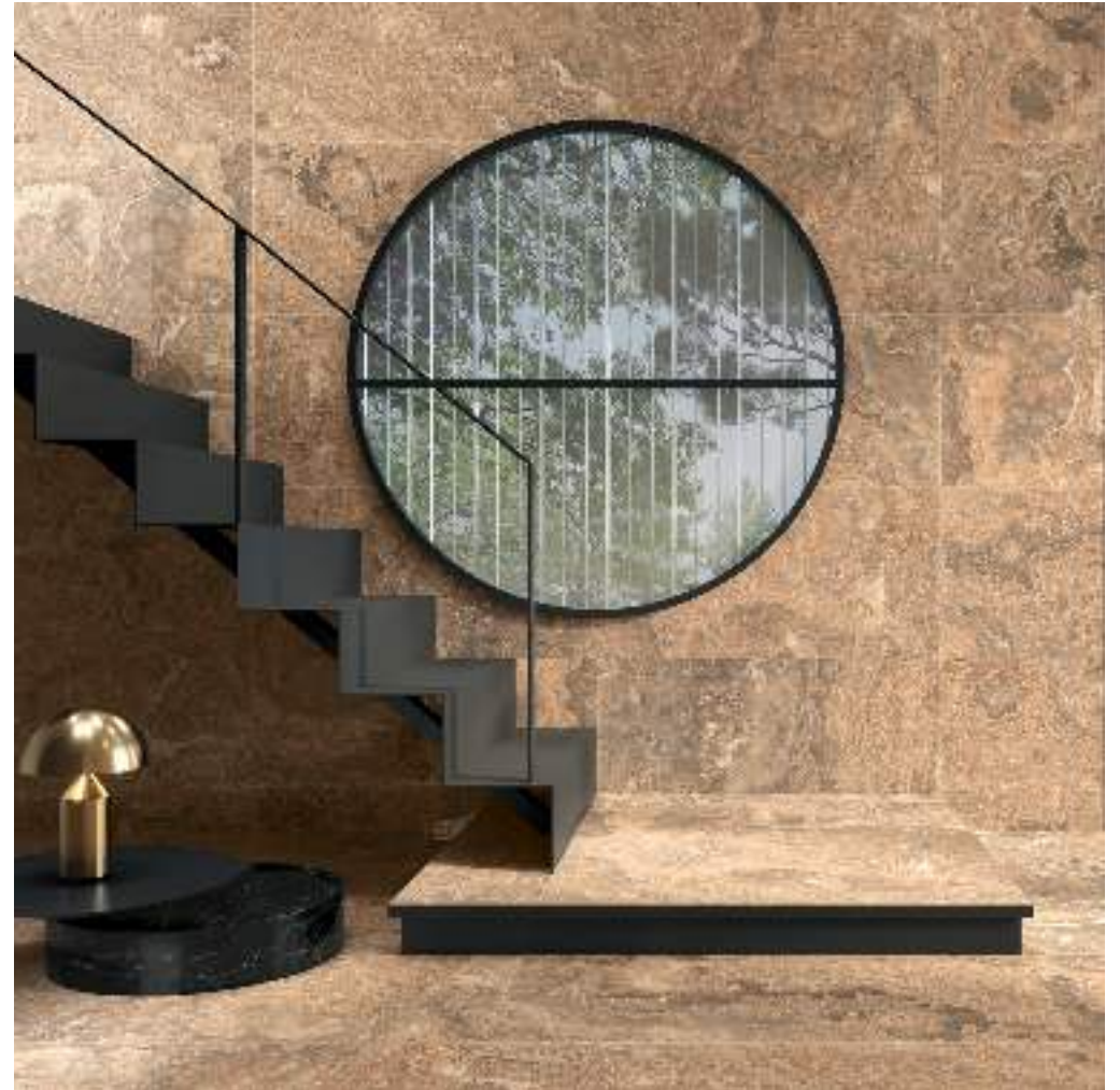
AGATE SUNSET LAP RECT. 60X120 / AGATE SUNSET LAP RECT. 90X90