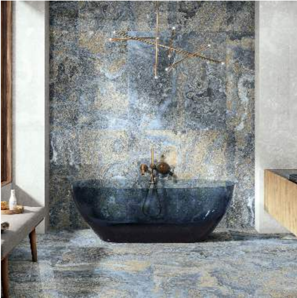
AGATE BLUE LAP RECT. 60X120 / AGATE BLUE LAP RECT. 90X90