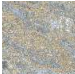
AGATE BLUE LAP RECT. 90X90 / 36"X36" L82/M