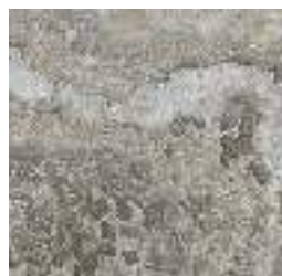
AGATE GREY LAP RECT. 90X90 / 36"X36" L82/M