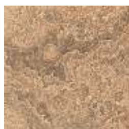
AGATE SUNSET LAP RECT. 90X90 / 36"X36" L82/M