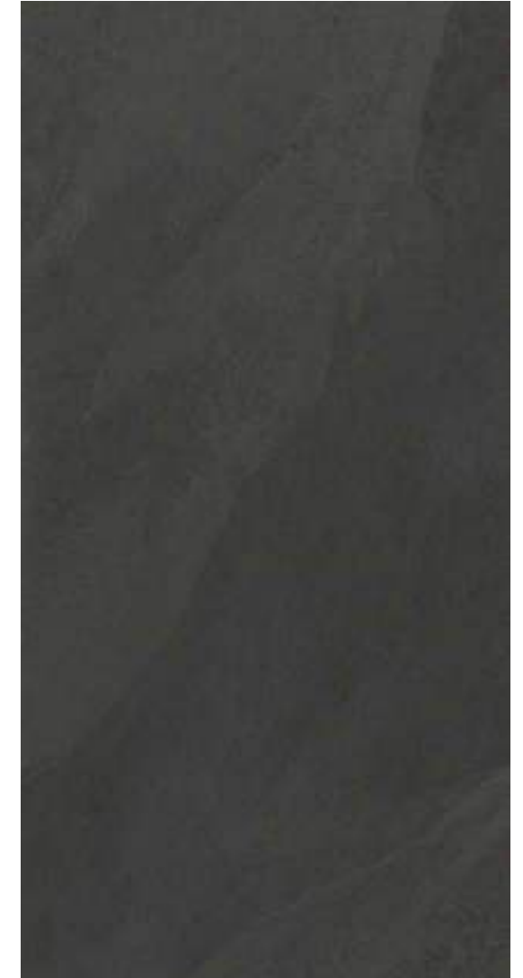
SMOKE 0447058 60x120