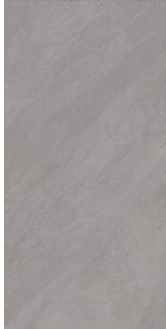
SILVER 0447057 60x120