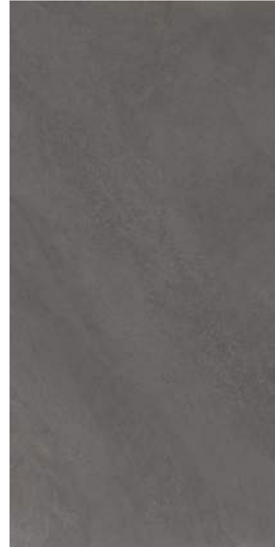
COAL 0447075 60x120