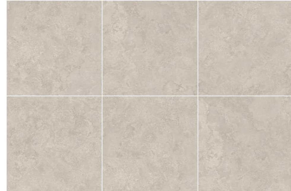
Sviluppo grafico Grey 90x90 Graphic development Grey 36"x36"