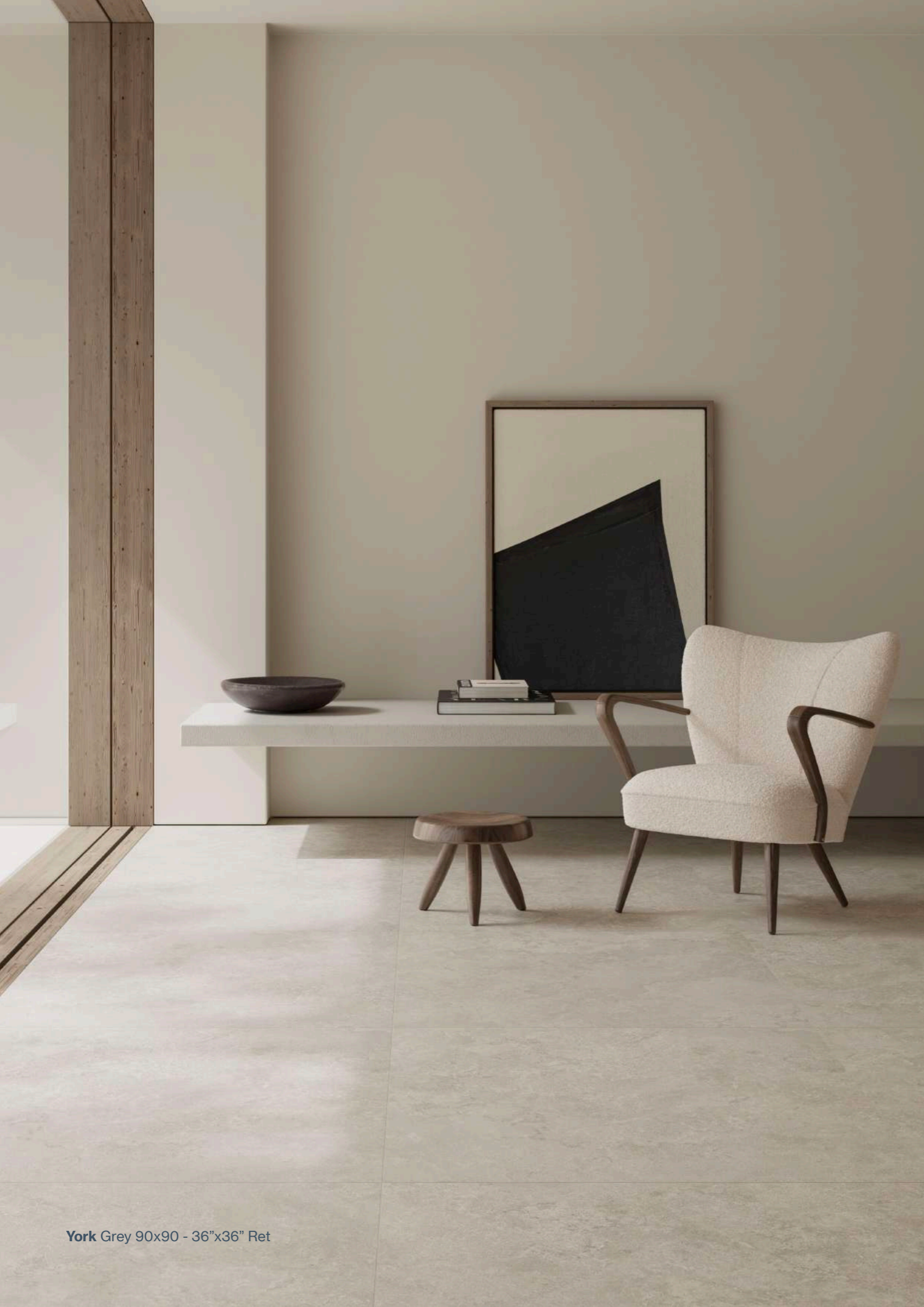
York Grey 90x90 - 36"x36" Ret