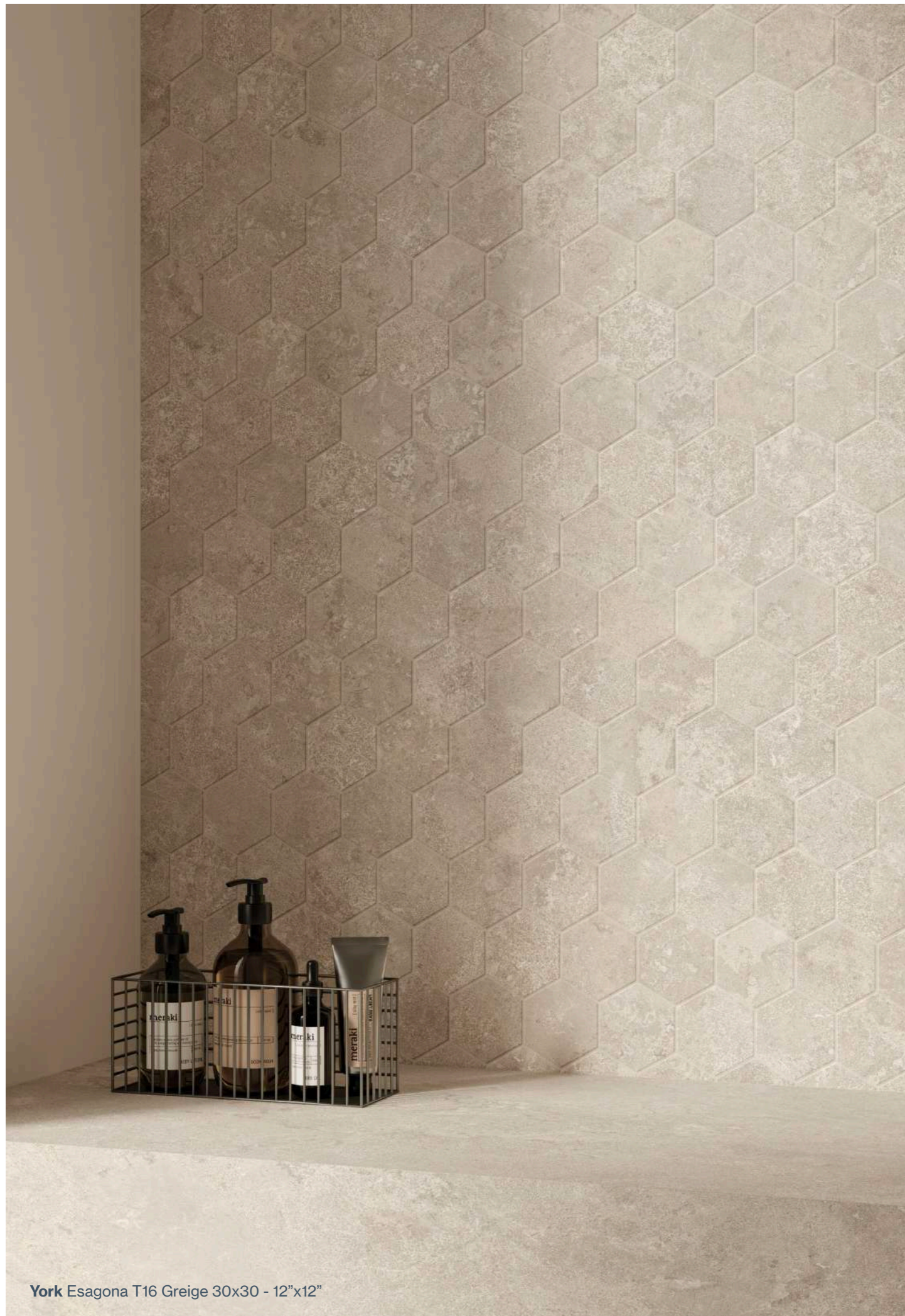
York Esagona T16 Greige 30x30 - 12"x12"