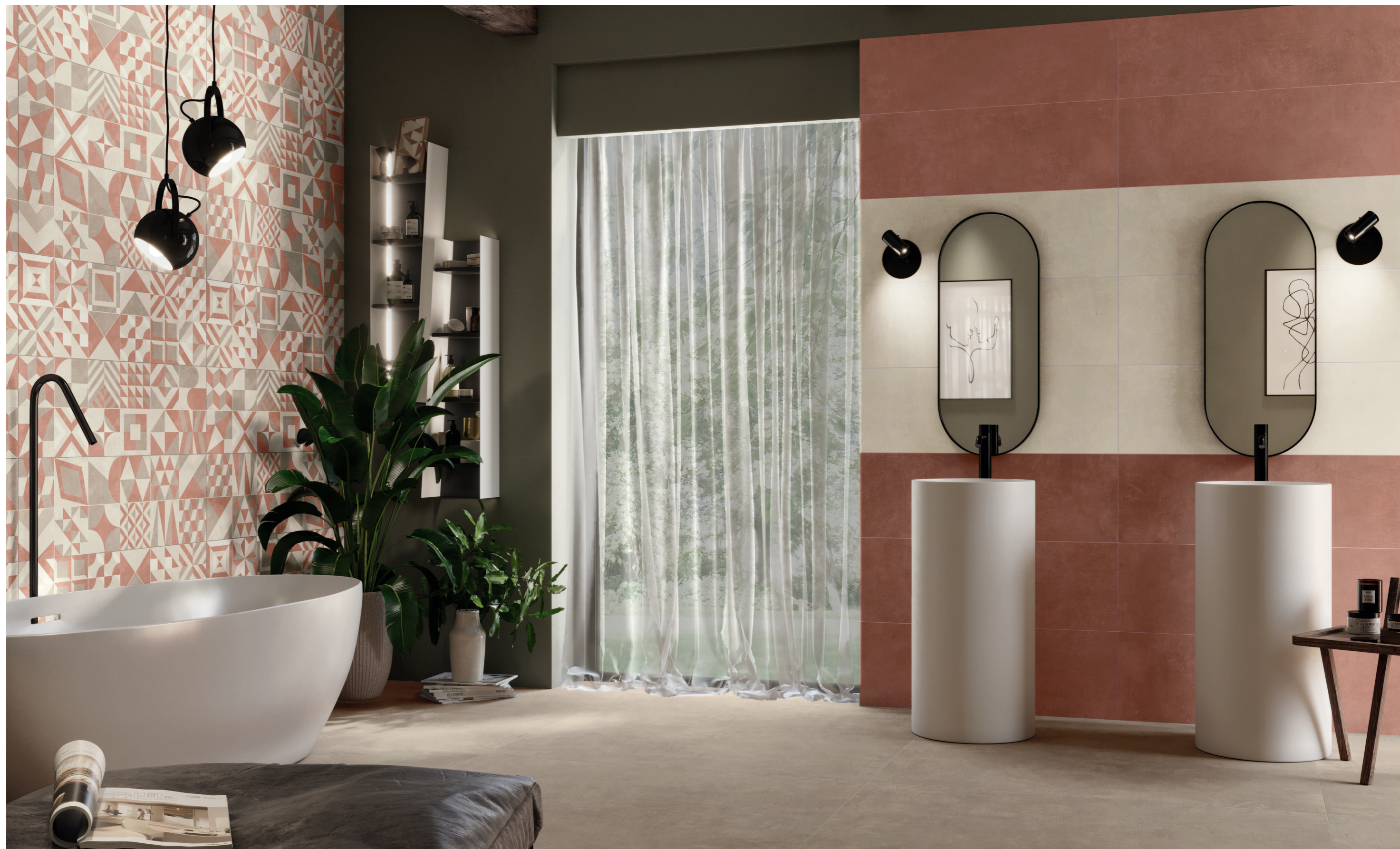
SABBIA 30x90 | CIPRIA 30x90 | MARMETTE CIPRIA 30x90 | MIELE 120x120