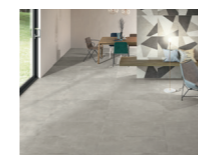
HIGHWAY p. 108

RECOMMENDED FLOOR TILES / SOLS CONSEILLÉ / EMPFOHLENE BÖDENFLIESEN