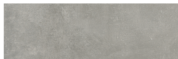
30x90 cm 0419111 CEMENTO