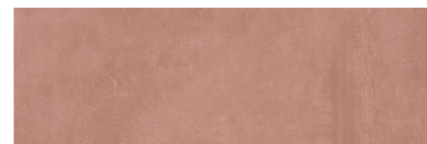
30x90 cm 0419120 CIPRIA