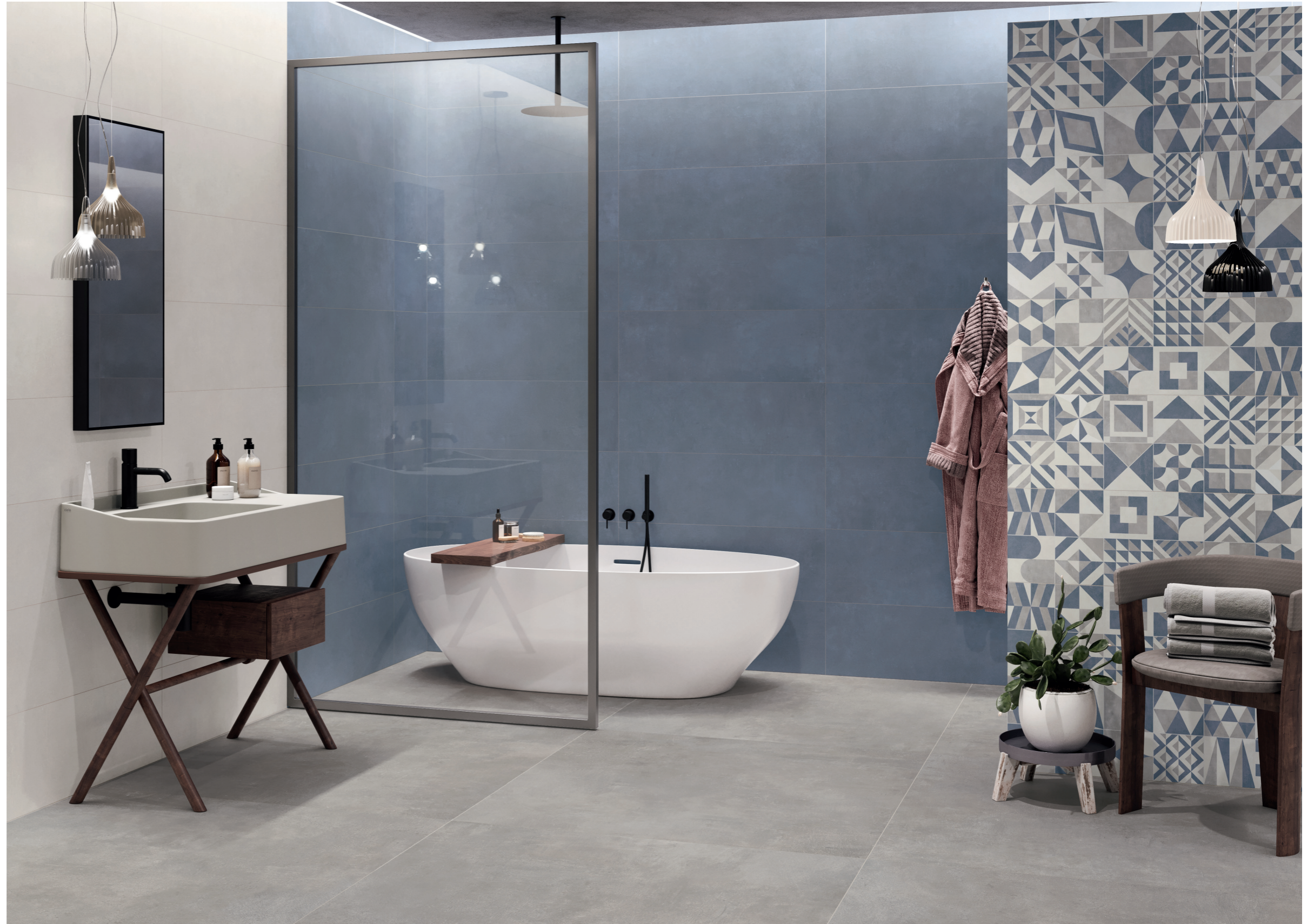
QUARZO 30x90 | BLU 30x90 | MARMETTE BLU 30x90 | ACCIAIO 120x120