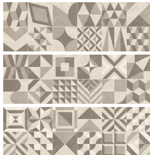
30x90 cm 0419115 MARMETTE SABBIA 1/2/3