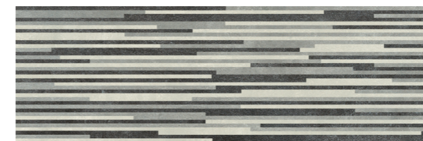
30x90 cm 0419116 MURETTO ARDESIA