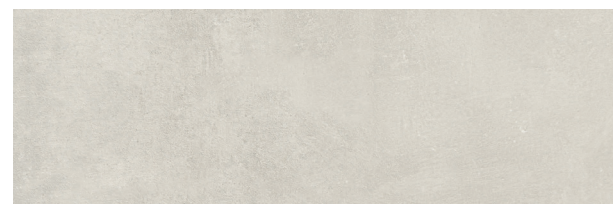
30x90 cm 0419109 QUARZO