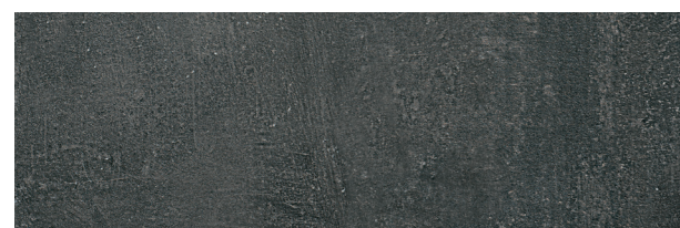
30x90 cm 0419110 ARDESIA