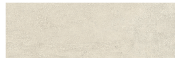
30x90 cm 0419112 SABBIA