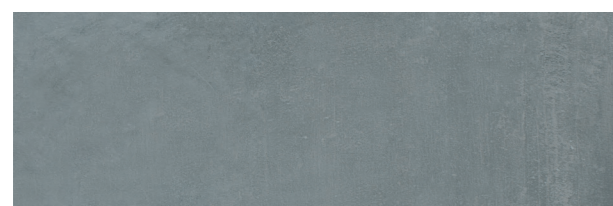
30x90 cm 0419119 VERDE