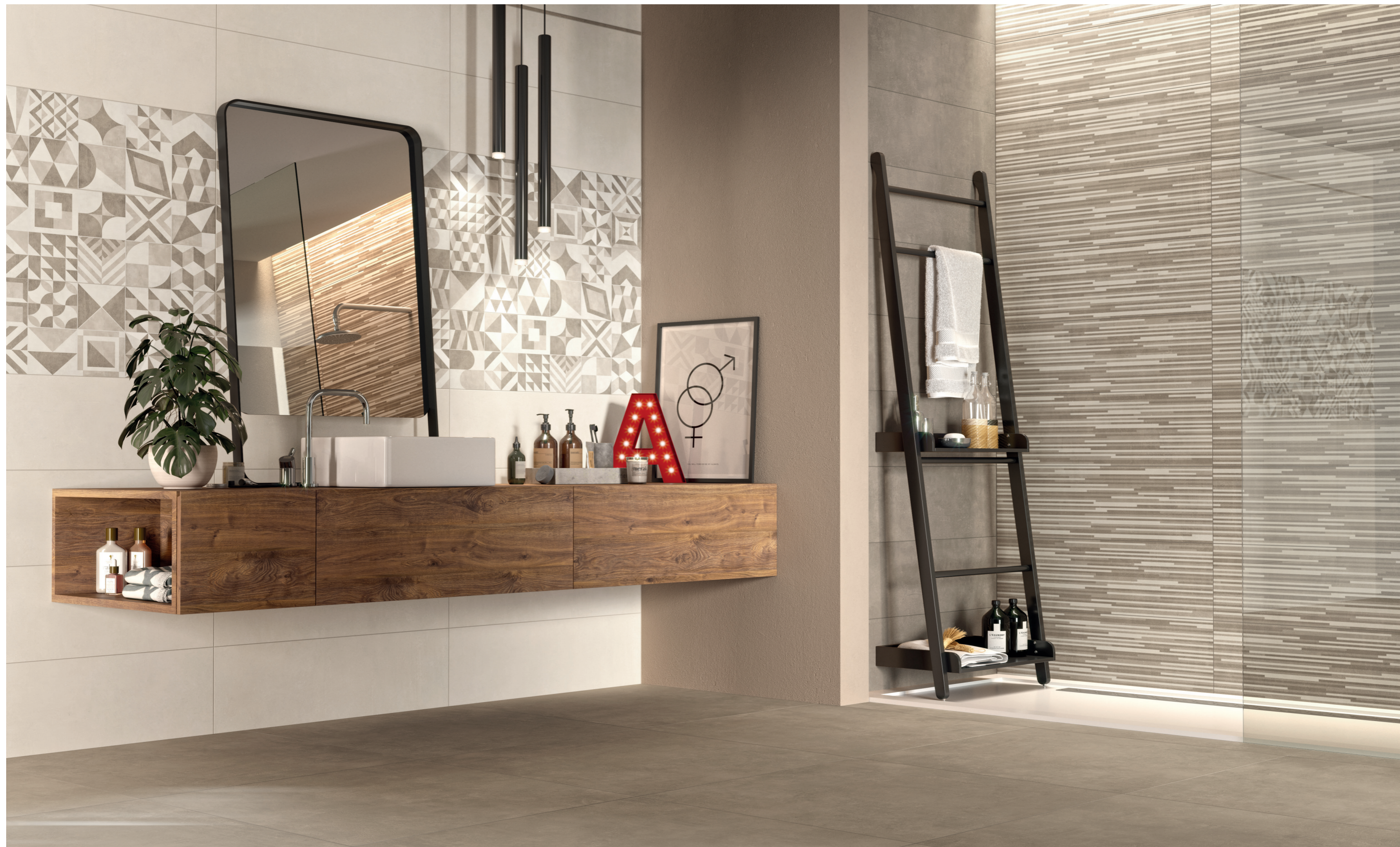
SABBIA 30x90 | BRONZO 30x90 | MURETTO BRONZO 30x90 | MARMETTE SABBIA 30x90 | BRONZO 80x80