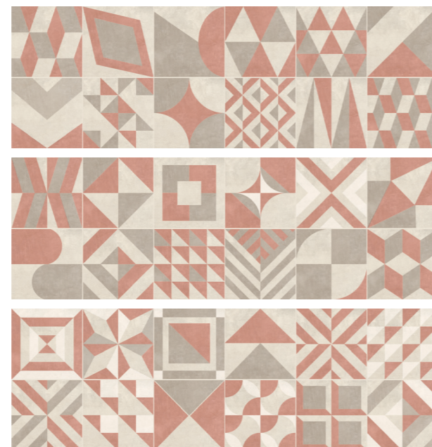
30x90 cm 0419123 MARMETTE CIPRIA 1/2/3