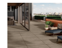
HIGHWAY 2.0 p. 240