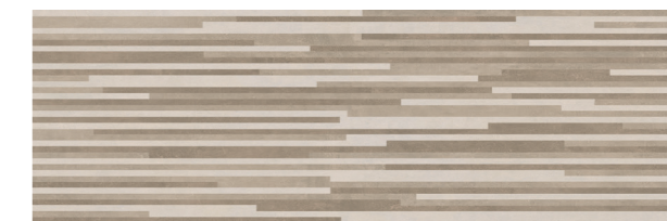
30x90 cm 0419117 MURETTO BRONZO