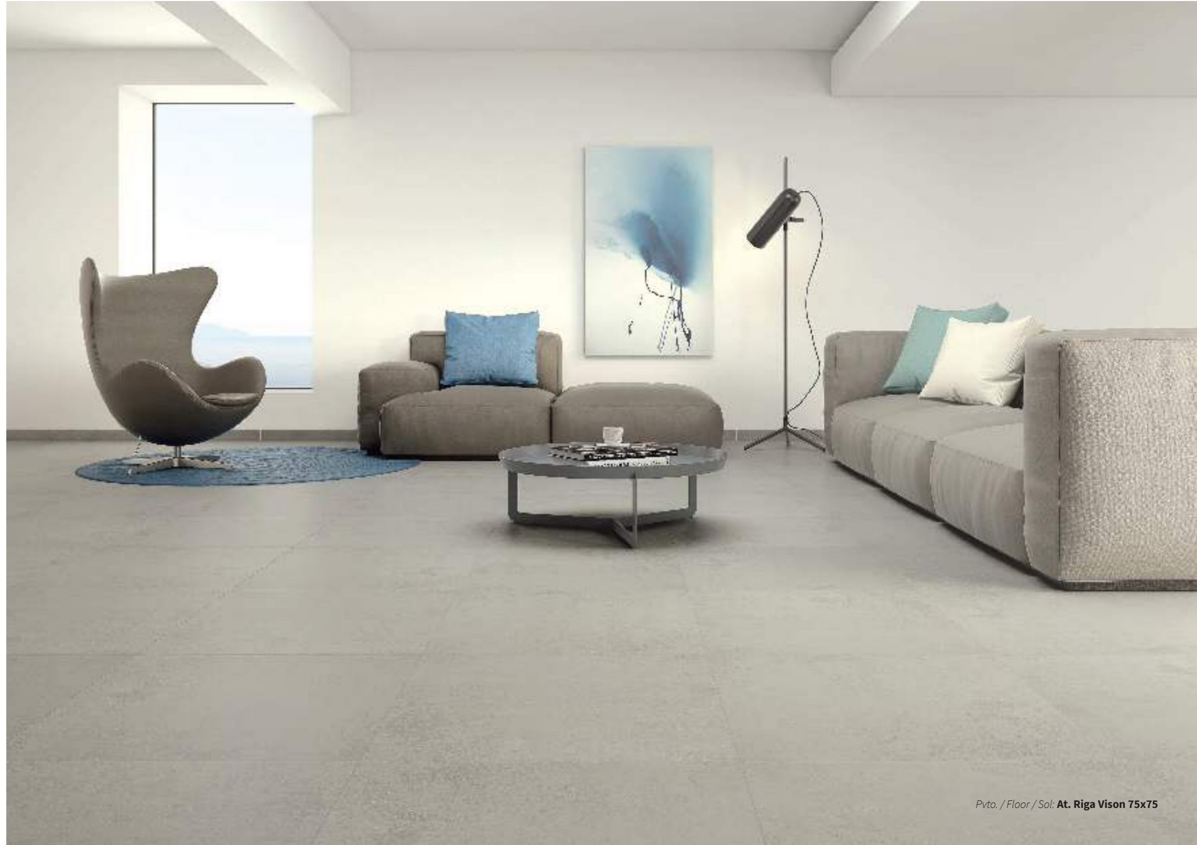
Pvto. / Floor / Sol: At. Riga Vison 75x75