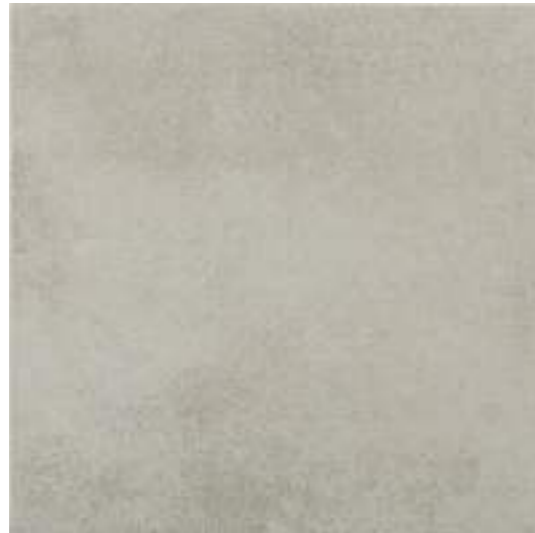
● At. Riga Vison 75x75 Rec. M43 017.875.0024.05231 ● At. Riga Vison 60x60 Rec. M37 017.840.0024.05231