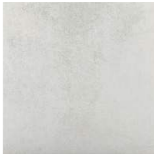
● At. Riga Perla 75x75 Rec. M43 017.875.0037.05231 ● At. Riga Perla 60x60 Rec. M37 017.840.0037.05231