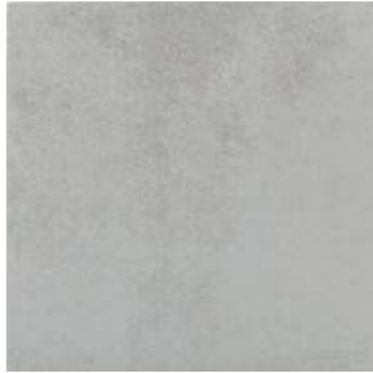
● At. Riga Gris 60x60 Rec. M37 017.840.0002.05231