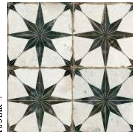
FS STAR N