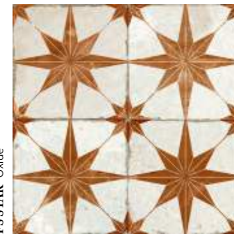
FS STAR Oxide