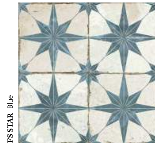
FS STAR Blue