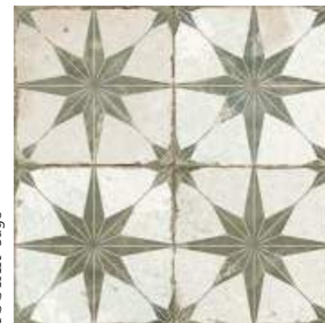
FS STAR Sage